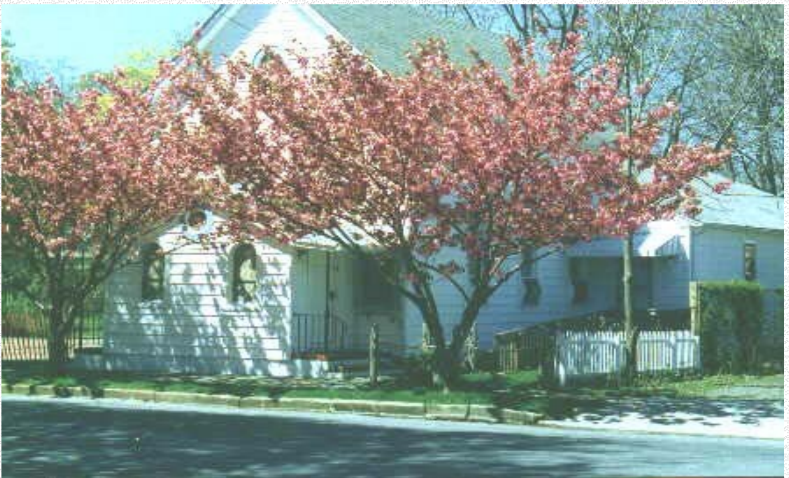
This view of the Greenport Synagogue shows the historic shul nearly obscured by the blooming trees that flank the entrance.